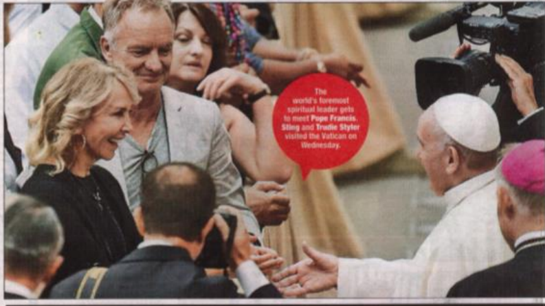
The world's youngest spiritual leader gets to meet Pope Francis, Sting and Tropic Styler visited the Vatican on Wednesday.