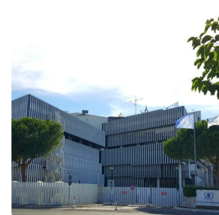
Wfp Headquarters In Rome