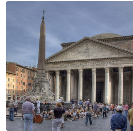
The Pantheon in Rome, Italy

AD CONTENT (http://link.abslcr.com/c/kyxgMnr25QNwYXvZ?src=t&title=Best+Places+to+Retire&campaign=775285&site=demandmedia-usat)