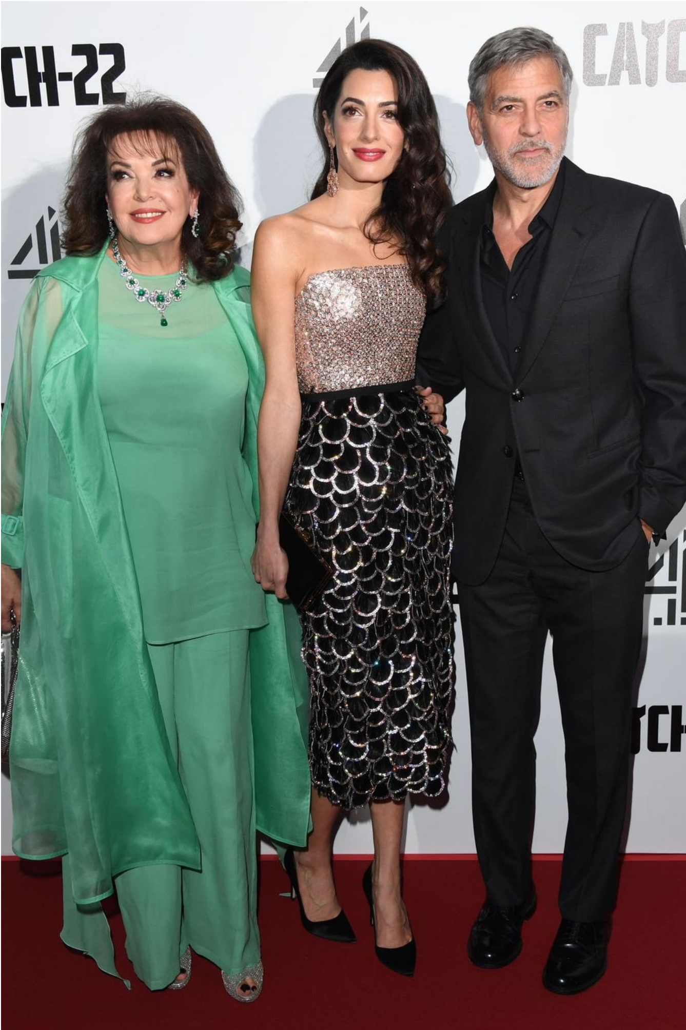
4 / 4 George Clooney, Amal Clooney and Baria Alumuddin at the London premiere of Catch-22.

mother, who looked stunning in a green pants, top and jacket combination. George Clooney, ever the minimalist, wore an all-black suit for the occasion.